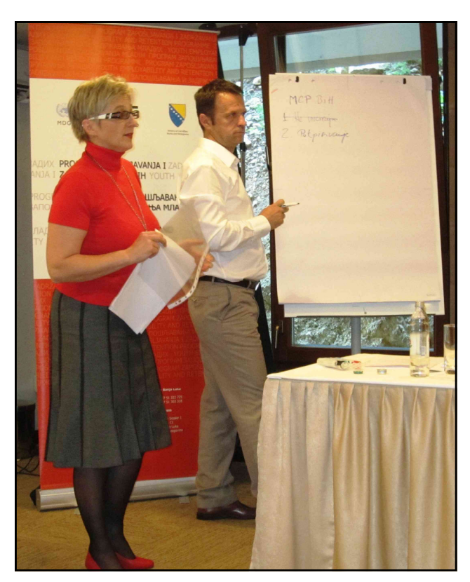
Participants at a recent meeting of the Youth Labour Migration Working Group. During the meeting, a mapping exercise was completed in order to identify institutional responsibilities in the process of legal labour migration.

As part of the project, IOM will design and implement a pilot circular/temporary migration (TCLM) scheme for both skilled and unskilled youth. IOM will work through its worldwide network of missions to identify work and internship opportunities abroad and match foreign labour demand with local labour supply. Opportunities in interested destination countries for seasonal employment primarily in the agriculture or tourism sectors will be identified. In addition, young Bosnians will be linked with internship opportunities abroad that will allow them to gain skills and experience in their chosen field.